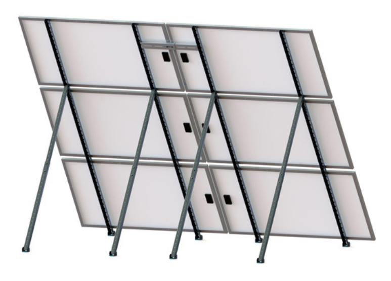
Picture above shows two UNI-GR mounts with the optional Ground Mount Intertie Kit installed.